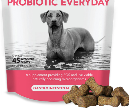
*This count not sold to Chewy and Amazon